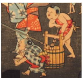
'Shogun's Road at Shitaya' From the series Comical Views of Famous Places in Edo Utagawa Hirokage Kyoto International Manga Museum

This is the second part of the charming Edo Giga exhibition presented by Japan Foundation Sydney in cooperation with the Kyoto International Manga Museum and International Manga Research Centre (the museum is well worth a visit should you go to Kyoto).