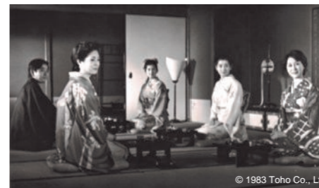
The Makioka Sisters, one of the classic Ichikawa films showing at the AGNSW

Also, throughout October the Art Gallery of New South Wales has been running the JFF Classics program, showcasing the works of Kon ICHIKAWA.